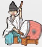
Doh (Large drum)

Izumo Kagura uses a variety of instruments including a large drum known as a doh , shimedaiko (small drums), flutes, Cymbals, and a variety of large and small hand drums. Shichiza uses the doh , shimedaiko , flutes, Cymbals, while shikisanba uses a large and small hand drums instead of the doh . In addition, kagura-noh most often uses shimedaiko , flutes, and Cymbals, with a doh added depending on the performance. The influence of Noh can be seen through the use of large and small hand drums.