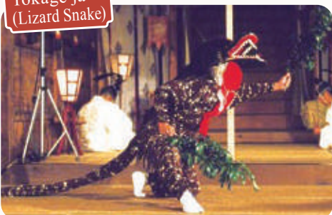
Ohara Shinshoku Kagura