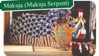
Okuiishi Shinshoku Kagura